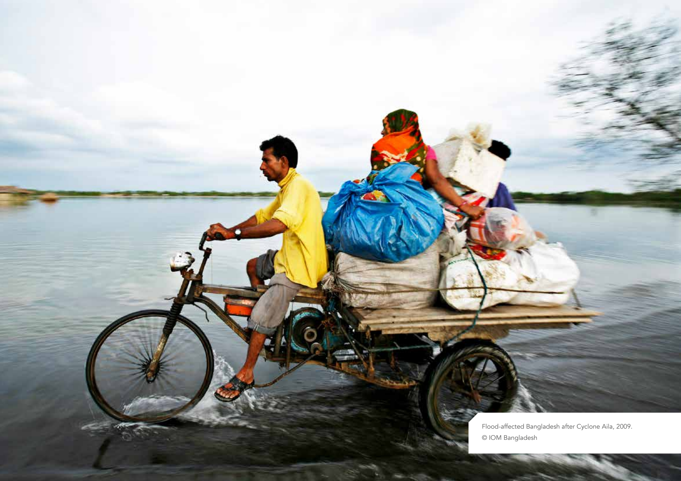
Flood-affected Bangladesh after Cyclone Aila, 2009.