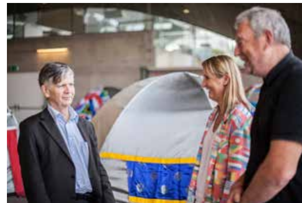
Top: Marie Velardi Atlas of Lost Islands (detail)